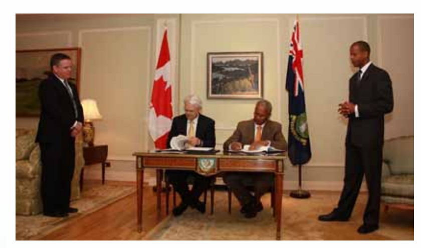
BVI SIGNS 24TH TIEA -GOVERNMENT OF CANADA

kets and to strengthen the Territory's relations with other Oversees Countries and Territories (OCTs), European Union (EU) and the United Kingdom (UK).