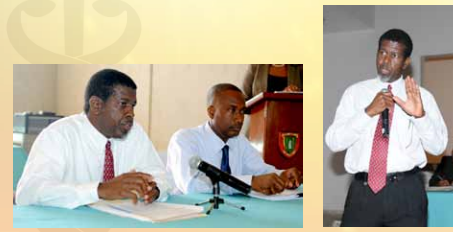
NATIONAL HEALTH INSURANCE INTERACTIVE COMMUNITY MEETINGS

(ii) healthcare benefits are equally available to everyone.