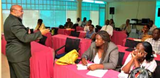
CXC REGISTRAR MEETS WITH PRINCIPALS AND EDUCATION OFFICERS

In creating a Culture of Excellence and in reforming the education system of the Virgin Islands, the Ministry of Education and Culture has forged ahead with implementing Key Stage Testing and the removal of the Primary Five Examinations; a Territorial Examination Board; raising of the grading scheme; mandatory sitting of Caribbean Examination Council (CXC) exams, creation of a fourth public secondary school and the professional development for teachers.