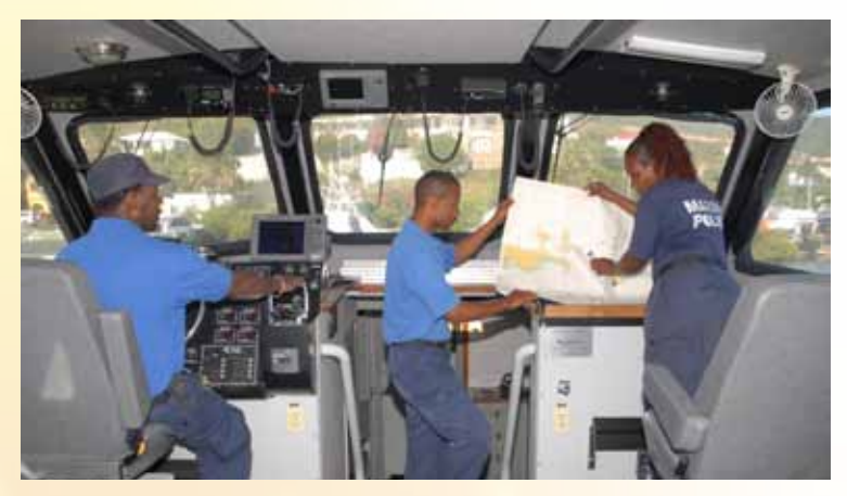
POLICE MARINE AT WORK

Steps are being taken to for Neighbourhood Police Officers to be present in other communities.