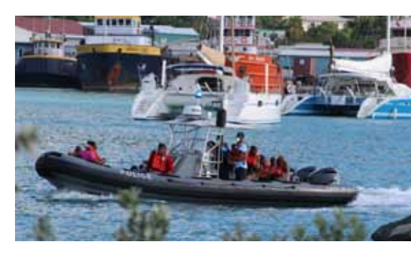
POLICE AT SEA

with the police force through the National Security Council to ensure the ongoing installation of CCTV surveillance cameras. In 2012, 24 cameras were purchased.