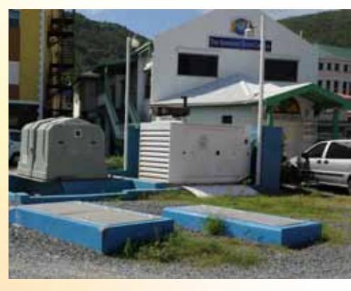
ROAD TOWN PUMP STATION