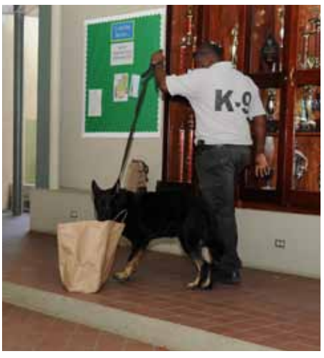
CUSTOM K-9 UNIT