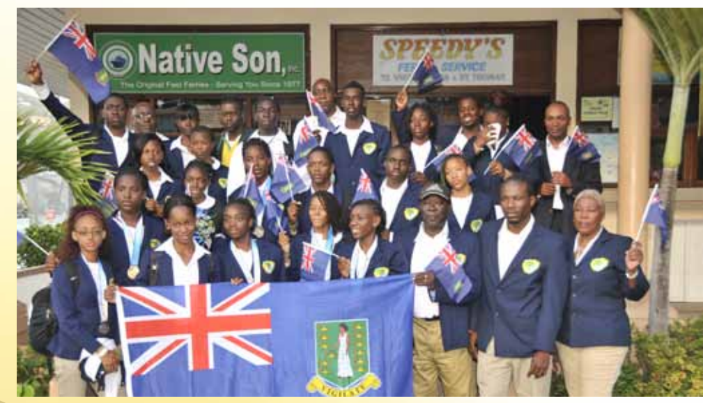
BVI CARIFTA TEAM