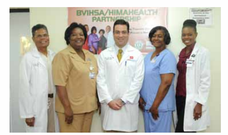
LAUNCH OF HIMA AGREEMENT

The purpose of the partnership was to provide specialist medical services in the treatment of cancers (oncology), the treatment of kidney diseases (nephrology), and the treatment of diseases of the nervous system (neurosurgery) to name a few.