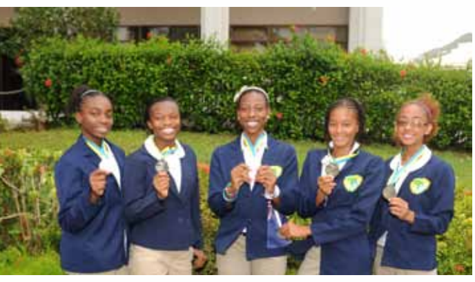
BVI RELAY TEAM

On June 28, 2013, Government announced that CXC would soon become mandatory for all school leavers.