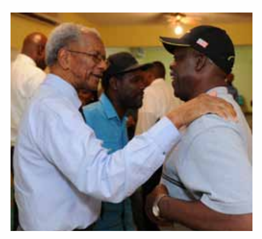
'ON THE ROAD' INTERACTIVE COMMUNITY MEETING

In keeping its commitment to openness and transparency, Government has held public numerous meetings in several areas and on several projects including Agriculture and Fishing, airport development, cruise ship development, small business development, road and infrastructural development, Virgin Gorda mini hospital, Gun Creek development, National Health Insurance, to name a few.