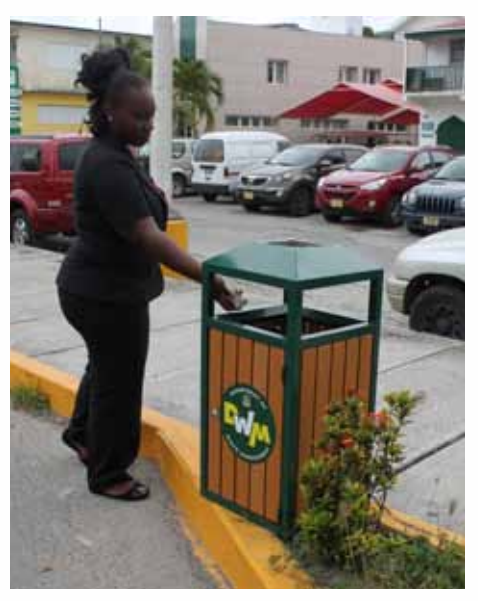
ROAD TOWN NEW LITTER BINS

Government introduced an island-wide 'Keep it Clean' campaign to encourage communities to assist with cleaning up the Virgin Islands. Clean-up included bush cutting, removal of derelict vehicles from the main public roads, the cleaning of coastlines, mangroves, Brandywine Bay Beach, Beef Island Beach and Trellis Bay among others.